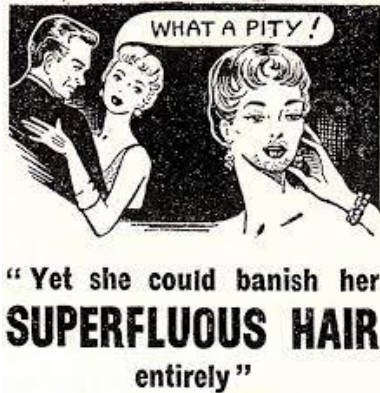
Figure 2 | Injunctive advertisement about how women ought to look

Injunctive norms have also been studied in isolation as powerful drivers of behavior. Injunctive norms are also found in advertisements; very often injunctive advertisements are linked to gender roles (Figure 2). Injunctive messages tend to shape ideas of what it's like to be an approved person: using the right product will make you popular, likeable, or accepted. Studies with injunctive norms do exist, 21 although researchers more commonly integrated in their empirical studies analysis of both injunctive and descriptive norms. Most studies have looked at the combined and relative effect of descriptive and injunctive norm. The evidence is mixed about which of the two norms is stronger, suggesting that the difference in the strength of their influence might be due to the behavior being influenced, as well as the characteristics of the population influenced by the norm (age, gender, or economic status), the relation between the influencers and the influenced (perceived social distance or proximity), or the characteristics of the context in which the influenced live (urban or rural, familiar or unfamiliar, for instance). 22