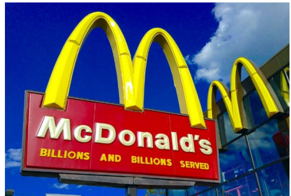
Figure 1 | Social proof on a McDonalds sign

Descriptive and injunctive norms can be powerful drivers of behavior when they work both independently and together. For years, experts in public advertisement have used the influence of descriptive norms: when people believe that many others are doing something, they will be more favorably oriented towards doing the same (Figure 1). Much empirical evidence on the influence of descriptive norms comes from studies conducted in high-income countries, many of which were carried out by researchers interested in: 1) increasing pro-environmental behavior 19 ; and 2) reducing consumption of alcohol on university campuses. 20