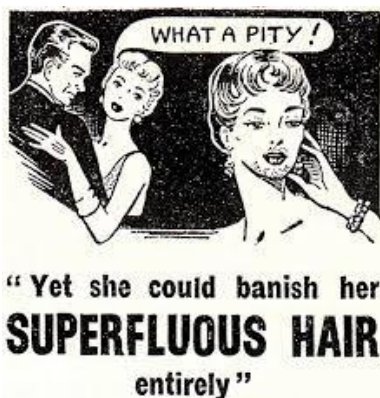
Figure 2 | Injunctive advertisement about how women ought to look

Injunctive norms have also been studied in isolation as powerful drivers of behavior. Injunctive norms are also found in advertisements; very often injunctive advertisements are linked to gender roles (Figure 2). Injunctive messages tend to shape ideas of what it's like to be an approved person: using the right product will make you popular, likeable, or accepted. Studies with injunctive norms do exist, 21 although researchers more commonly integrated in their empirical studies analysis of both injunctive and descriptive norms. Most studies have looked at the combined and relative effect of descriptive and injunctive norm. The evidence is mixed about which of the two norms is stronger, suggesting that the difference in the strength of their influence might be due to the behavior being influenced, as well as the characteristics of the population influenced by the norm (age, gender, or economic status), the relation between the influencers and the influenced (perceived social distance or proximity), or the characteristics of the context in which the influenced live (urban or rural, familiar or unfamiliar, for instance). 22