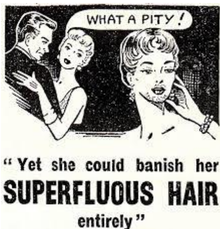
Figure 2 | Injunctive advertisement about how women ought to look

Injunctive norms have also been studied in isolation as powerful drivers of behavior. Injunctive norms are also found in advertisements; very often injunctive advertisements are linked to gender roles (Figure 2). Injunctive messages tend to shape ideas of what it's like to be an approved person: using the right product will make you popular, likeable, or accepted. Studies with injunctive norms do exist, 21 although researchers more commonly integrated in their empirical studies analysis of both injunctive and descriptive norms. Most studies have looked at the combined and relative effect of descriptive and injunctive norm. The evidence is mixed about which of the two norms is stronger, suggesting that the difference in the strength of their influence might be due to the behavior being influenced, as well as the characteristics of the population influenced by the norm (age, gender, or economic status), the relation between the influencers and the influenced (perceived social distance or proximity), or the characteristics of the context in which the influenced live (urban or rural, familiar or unfamiliar, for instance). 22