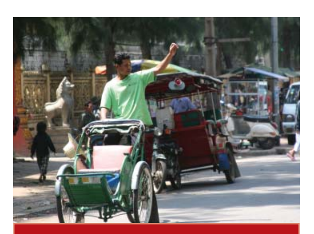
We gather together and we chat... because our goal is: today I want to have sex with a girl. So, I go to meet my friend and see whether he has money. We know that we want to have sex already at the start. [Unmarried, 30-year-old motorcycle taxi driver]

The data reveal two principal decision-I making patterns that result in men seeking sex when out socializing in Phnom Penh. The first results from having discussed a plan for the evening in advance with group mates that includes, explicitly, the goal to seek sex, usually by bringing a woman to a guesthouse or visiting a brothel. This can be characterized as instrumental sex-seeking. Instrumental sex-seeking creates more certainty and produces less anxiety and fewer tactics for evasion among men who are ambivalent about seeking sex. While most men say they are enthusiastic when their friends invite them to an evening of sex-seeking-oriented socializing, men in the study describe being more able to say no when they are called or visited by a peer who wishes to plan a night that includes sex before the night has commenced.